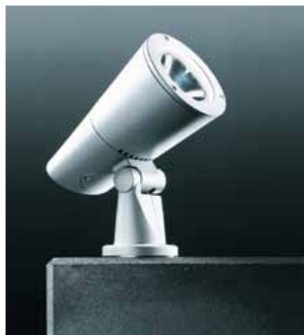
OPPOSITE Corridors outside the auditorium echo its fluid forms ABOVE Regent's Place Pavillion by Carmody Groarke Architects, with RAD 250 IP68 LED buried upright luminaires designed by David Morgan Associates, pictured top right RIGHT Louis Poulsen SPR12 projector luminaire, designed by David Morgan Associates

dmadesign.co.uk Radiant Lighting is available in Australia from JSB Lighting jsblighting.com.au