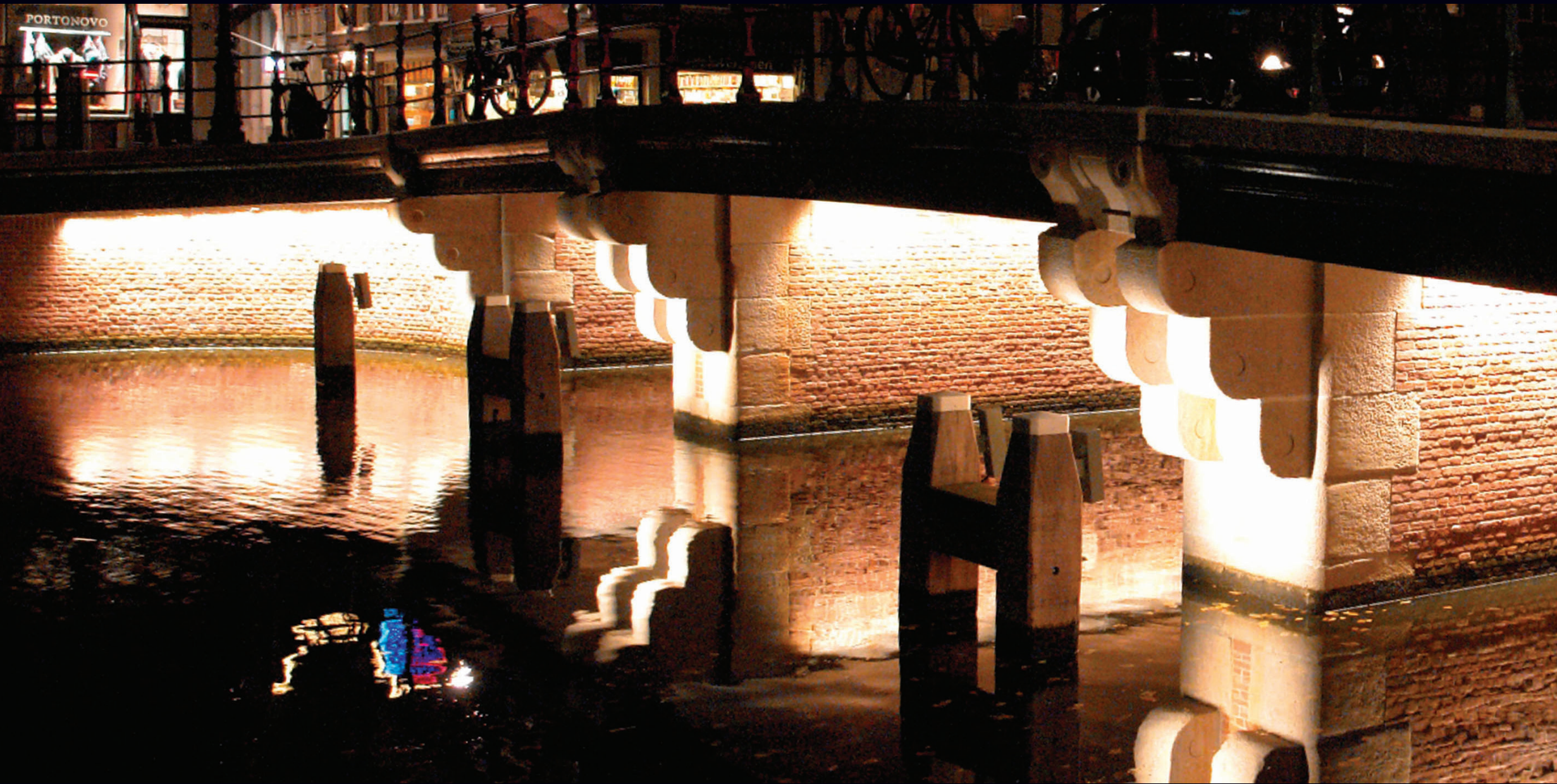
Bridge 5, Amsterdam Lighting design by Kees van de Lagemaat

Kees van de Lagemaat specified Radiant’s 3D LED Flex 40 IP66 System to illuminate the underside of Bridge 5, in the heart of Amsterdam.