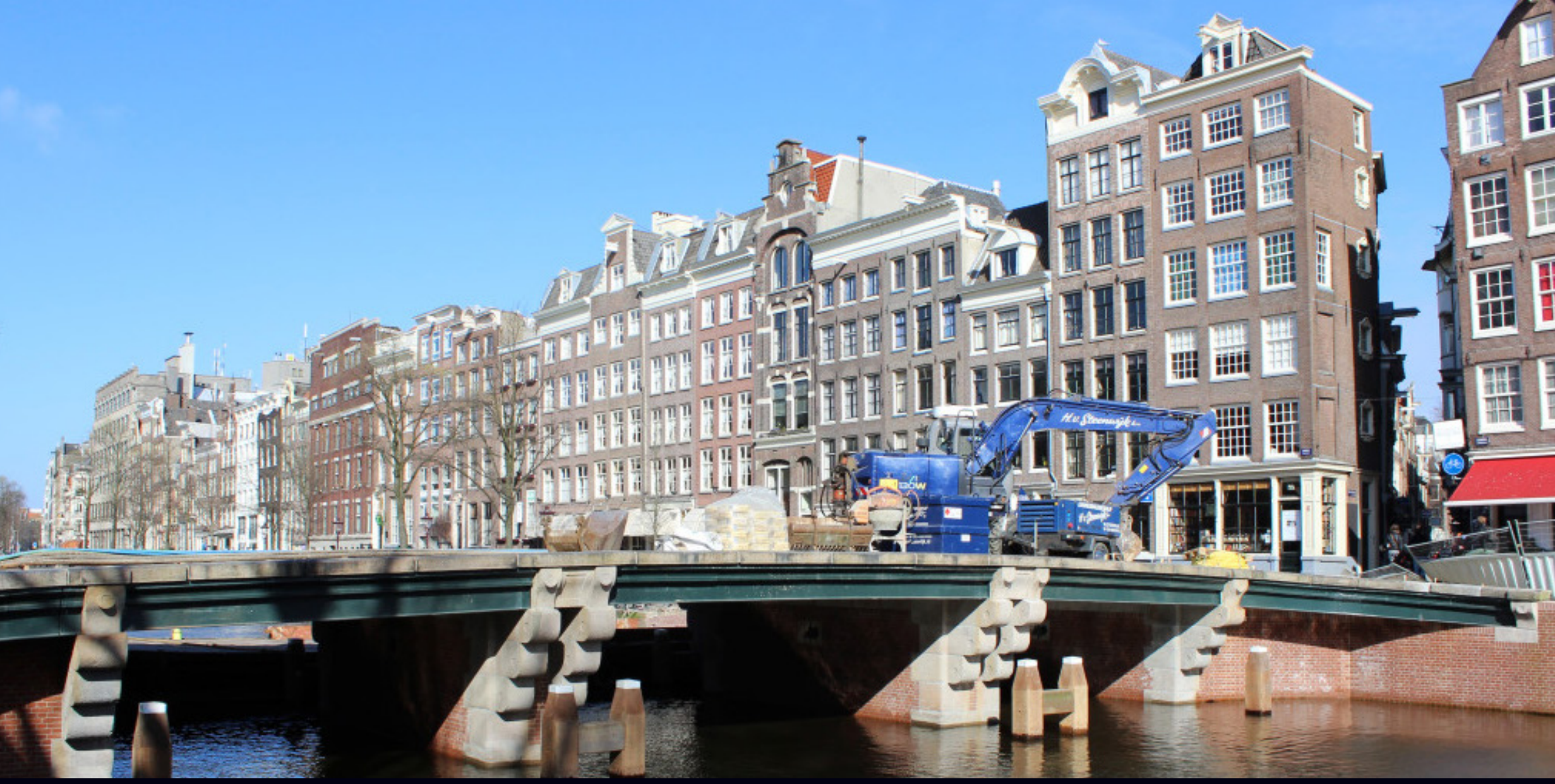
Bridge 5 during renovation work in 2014